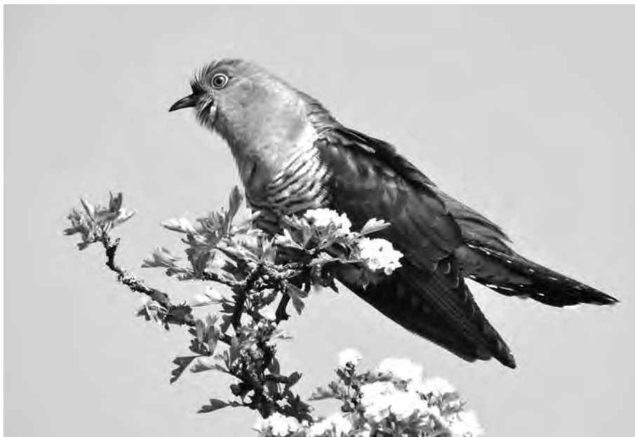
Cuckoo

Have you ever wondered where all the information that is used by the media and various environmental organisations comes from? One of the lesser known and most rigorous sources is the British Trust for Ornithology, who have recently published the results of one of their many surveys.